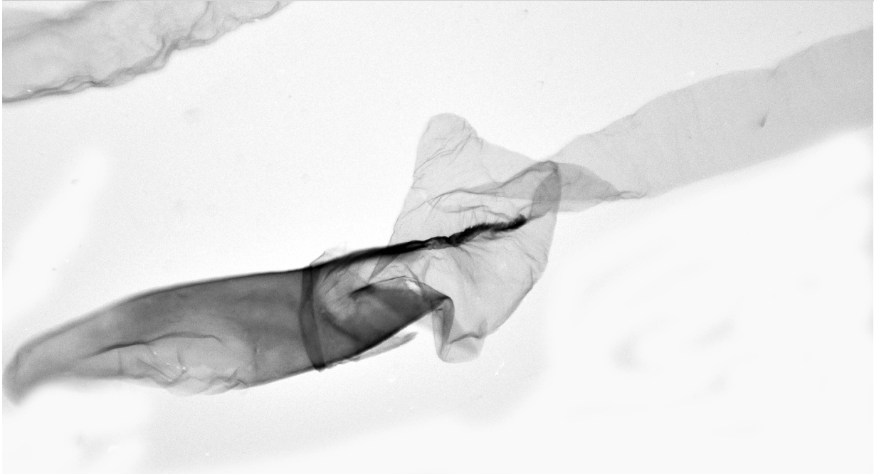
Fig. 4 Militagrotis militaris (STAUDINGER, 1888): male genitalic apparatus, below detail of the extremely long vesica, both are within the range of the resp. structures of the Agrotis -spp. s.l. Prep. P. Gyulai.