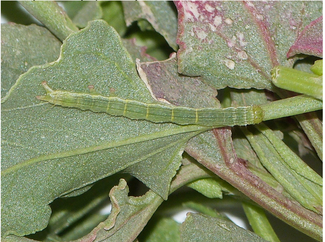
Fig. 1. The larva of Scythocentropus inquinata (MABILLE, 1888)

Habitually striking and characteristic at the larva of Scythocentropus inquinata is the very slender body (quite in contrast to the stout-bodied larvae of the trifine Noctuidae) which remembers by the longish segments A1 to A4 and the relatively short segments A5, A6 of the quadrifine Catocalinae. The posture of the sideward directed prolegs on A5 and A6 and that of the oblique-backward directed anal-prolegs is the same as at the Catocalinae, generally of the quadrifine Noctuidae, the prolegs on A3 and A4 are not visible, perhaps not fully developed (as at quadrifines). The Dorsale is split. All these characters are to be found only with many quadrifines, e.g. at Colobochyla salicalis ([DENIS & SCHIFFERMÜLLER], 1775), Catocala SCHRANK-spp., Drasteria HÜBNER-spp. or at Dysgonia HÜBNER-spp.